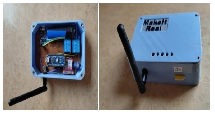
Fig. 4 Image of second modified prototype