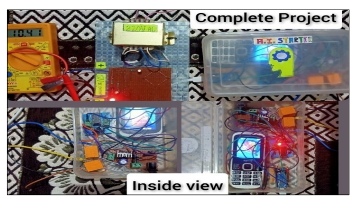
Fig. 3 Image of first prototype

The first image of our working smart switch model/prototype is show in Fig. 3 in which we use a simple mobile phone for call and SMS for the generation of vibrations. These vibrations are used for further process or detection of phase. The cost of this project is high. So, we further modified our prototype with new one whose image is shown in Fig. 4. The modified prototype is compact in size and low cost. Here, we replace a simple mobile phone with a GSM module whose cost is less as compare to phone.