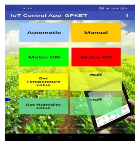
Figure 3. User Interface of APP

Hardware requirements for this project are as follows: